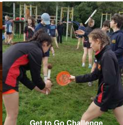
Get to Go Challenge