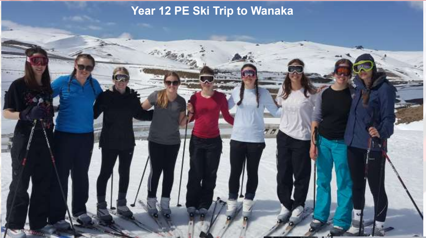
Year 12 PE Ski Trip to Wanaka