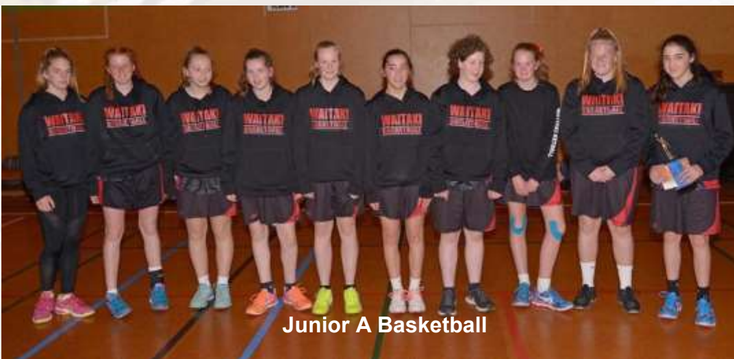
Junior A Basketball