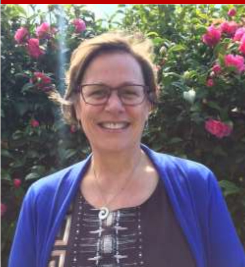
Tēnā Koutou Katoa

Naumai Haere Mai Te Wiki o Te Reo Māori. Yes, the official week to celebrate Māori Language Week is over but we are committed as teachers to widen our learning and understanding of Te Reo Māori and Tikanga Māori in the belief that, “the culture of the child cannot enter the classroom until it has entered the consciousness of the teacher.” As staff, we are having Waiata Wednesday to learn waiata and pronunciation and we continue our Mana Wahine programme, enabling Māori