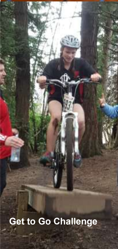
Get to Go Challenge